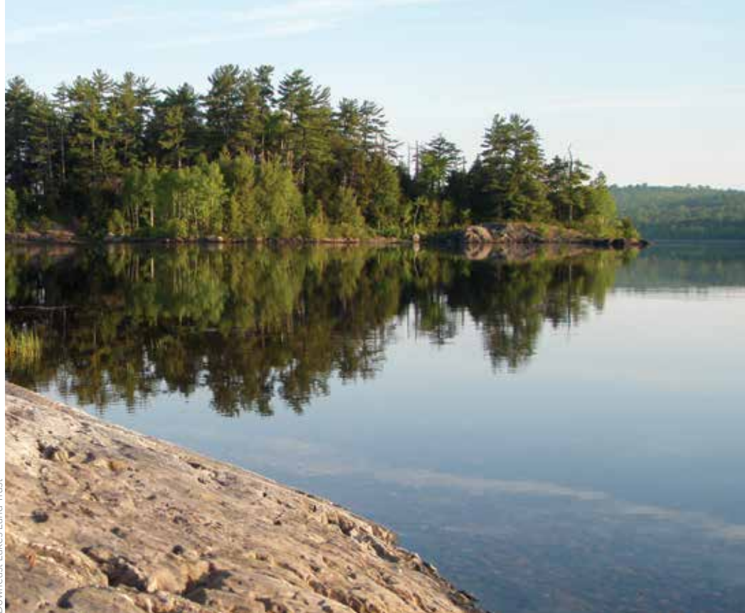
Downeast Lakes Land Trust

Financially, not having a hemlock market means we have to adjust our allowable harvest to not overharvest the other species. We can't just take the same volume we have been harvesting for the past 10 plus years, and then just throw it all at hardwood, spruce and